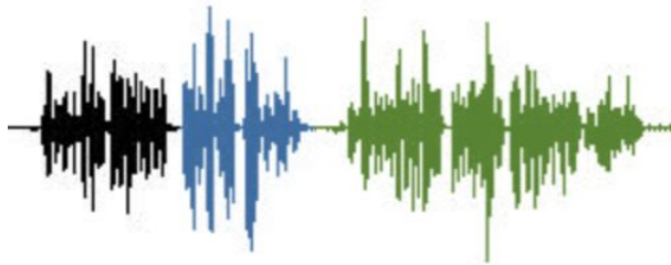
Figure 2: An example of a forced alignment that produced two same-word clusters (in blue and green) and discarded a few (stricken out) as too noisy. The words "well" and "borrow" will be used as hard negative examples for "will" and "tomorrow" respectively.

We aim at grouping pairs of words that sound the same as positive examples; ones that sound slightly different as hard negative examples; and ones that sound different as typical negative examples.